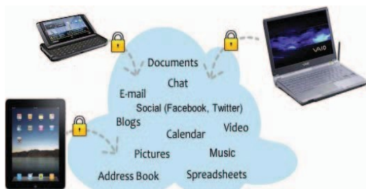
Figure 1. A Cloud Computing Scenario [7]

In this paper, we provide a comprehensive overview of interactive load balancing algorithms in cloud computing. Each algorithm addresses different problems from different aspects and provides different solutions. Some limitations of existing algorithms are performance issue, larger processing time, starvation and limited to the environment where load variations are few etc. A good load balancing algorithm should avoid the over loading of one node. The aim is to evaluate the performance of the cloud computing load balancing algorithms that have been developed over the period of 2004-2015. The rest of the paper is organized as follows. In section II, we compare review different load balancing algorithms. In Section III, the performance evaluation of different cloud computing algorithms have been discussed and evaluated with the help of multiple tables. Our discussion and findings are summarized and the paper is concluded in section IV.