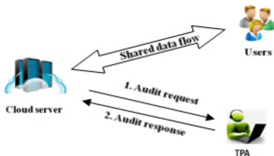
Figure 1: System Architecture.

In our system architecture have three members they are cloud server, public verifier (TPA), users. The cloud server contains the different types of data like shared data or meta data or private data. The TPA provides auditing services and checking any data integrity in the cloud server and also watching any unauthorized users are accessing the shared data. In this architecture we have two types of users they are owner (original user) of the data and group users. The original user will shares the data to the group users. Group users will access or modify the shared data from the cloud server but who are registered in the group only.