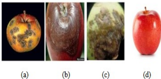
Figure: 1 Three common apple fruit diseases: (a) apple scab (b) apple rot(c) apple blotch (d)normal apple

Grading of the samples is a daunting task, one of the major reasons being the difference of personal knowledge and practical experience, the same samples are classified into different grades by different experts. Therefore, the result is usually subjective and it is impossible to measure the disease severity precisely as the outcomes may vary and could be misleading. The apple fruit diseases are apple scab, brown rot, core rot, apple blotch, Sooty blotch and block rot canker. The following are the few images that effects apple fruit: